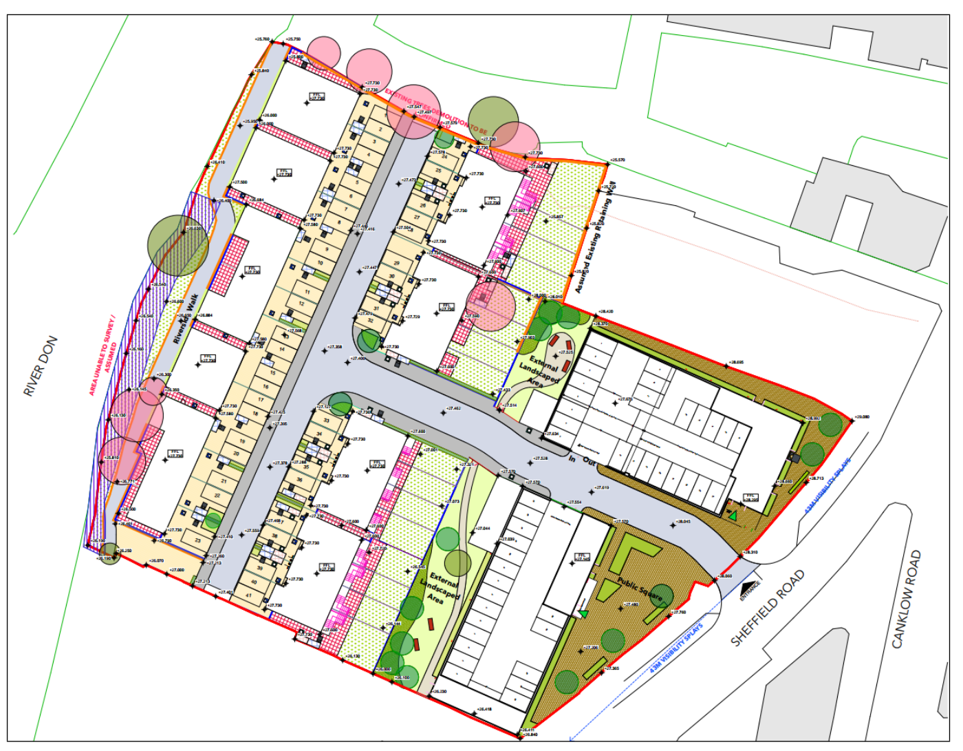
Appendix 1: Sheffield Road Car Park